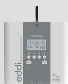
myenergi Eddi energy diverter C2160 (in selected markets only)