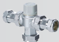
Tempering valve C5388